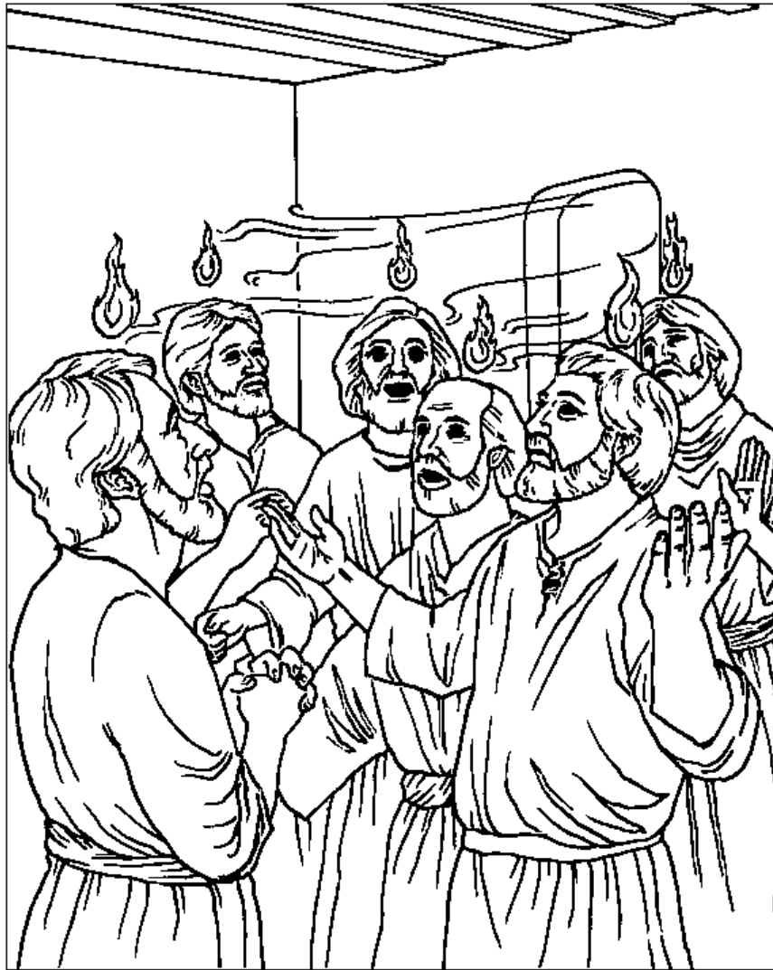
The Day of Pentecost Acts 2

Each number represents a letter of the alphabet. Substitute the correct letter for the numbers to reveal the coded words.