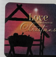
Clinton Christian Church 2025 Advent Devotional