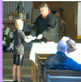
Far Left: On Easter morning each person that was baptized received a certificate and their baptismal candle.