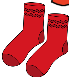
LOW CUT SOCKS