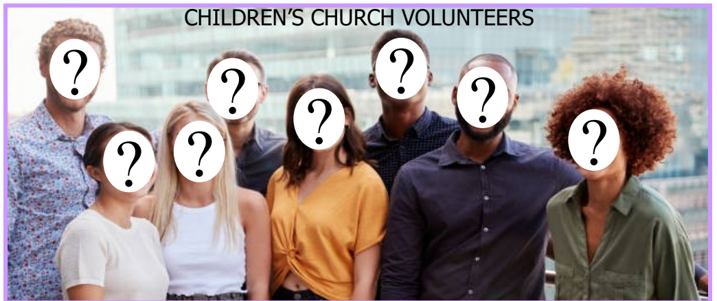
CHILDREN'S CHURCH VOLUNTEERS

As we look back on the effects COVID had on the church in general we probably see most churches were effected by lower attendance. Clinton Christian Church, however, rejoices that our attendance has not only reached pre-COVID numbers but has exceeded them. Our best blessing coming out of COVID has been the larger number of kids that we have attending. WHY IS THIS YOU MIGHT ASK? Because we have a group of volunteers (pictured above) that have taken it upon themselves to answer God's call to love and teach our kids. A wonderful part of this is that the majority of these volunteers grew up in Clinton Christian Church* and they know how important the kids are in the life of the church. HOWEVER, as the number of kids each week grows (15-20) these leaders are in need of some special volunteers. There is no planning of the lesson and no hands on teaching involved. They just need some extra hands to help out, to be an adult presence, to even the numbers a bit. There is a sign up sheet in the lobby. Is God calling you to help out to this ministry that is so important in the life of Clinton Christian Church?