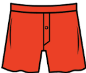
BOXERS FOR BOYS

EVERYTHING IN LIFE IS BETTER WITH NEW UNDERWEAR AND SOCKS OUR CHURCH-WIDE OUTREACH PROJECT FOR JUNE WE WILL BE COLLECTING NEW UNDERWEAR AND SOCKS FOR CLINTON SCHOOL DISTRICT'S BRIGHT FUTURES PROGRAM AND THEIR BACK TO SCHOOL FAIR