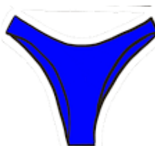
BIKINI FOR GIRLS