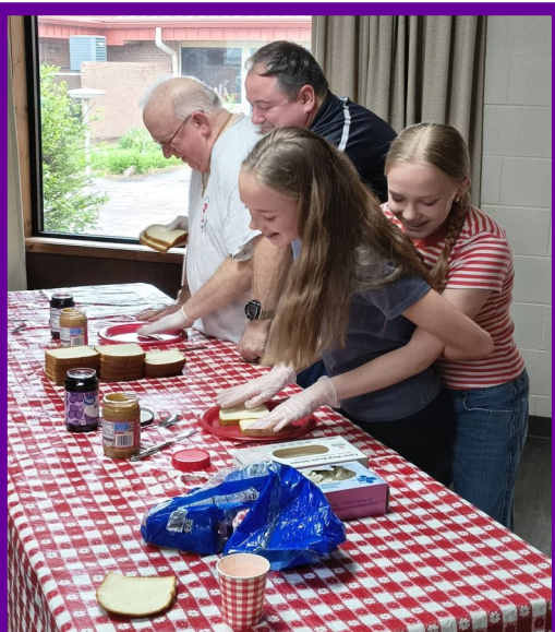
We had "team building" games. "Team Building Sandwiches" games

Our Youth said blessings over each part of the new kitchen; blessing its use and all that use it.