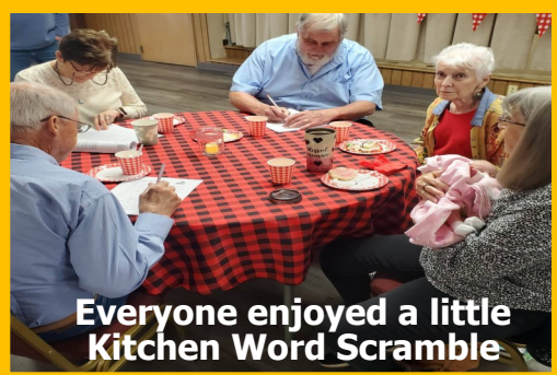
Everyone enjoyed a little Kitchen Word Scramble

Clinton Christian Church held a Kitchen Shower to celebrate and to bless our new kitchen and its many users.