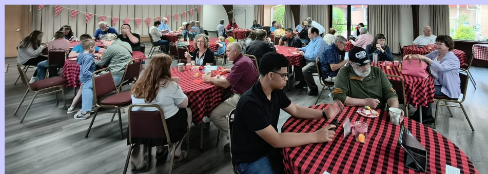
Lots of people stayed and helped bless our New Kitchen