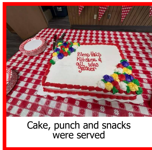
Cake, punch and snacks were served