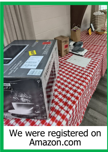
We were registered on Amazon.com